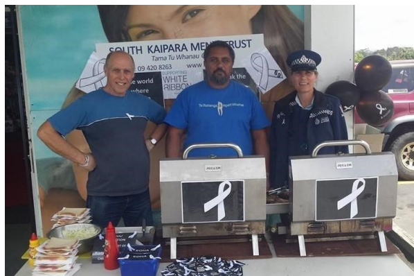
White Ribbon Day BBQ in Helensville