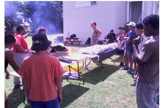
The Kai Takawaenga feeds the hearts of young men with instruction on hangi preparation

The Kai Takawaenga or 'bridge', with the support of the ASB Community Trust, has been active in Kaipara College since 2011. By building or bridging relationships between the young person, whānau and the school the Kai Takawaenga provides practical assistance to young people to remain in the school, achieve and find a pathway to further