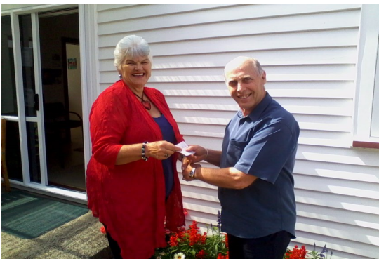
A cheque, the proceeds of the White Ribbon Day BBQ in support for the Helensville Women & Family Centre Christmas Appeal, is handed over

The Trust's services and programmes are now organized and delivered out of Alison McKenzie House. The services are directed towards the needs of men, young men and their families. The Trust works collaboratively with other local and regional providers in order to offer the best possible service to the community..Our slogan Tama Tu Whanau Ora indicates that the aim of the Trust is to support men to stand tall and strong so that their relationships, families and communities may be healthy and enriching.