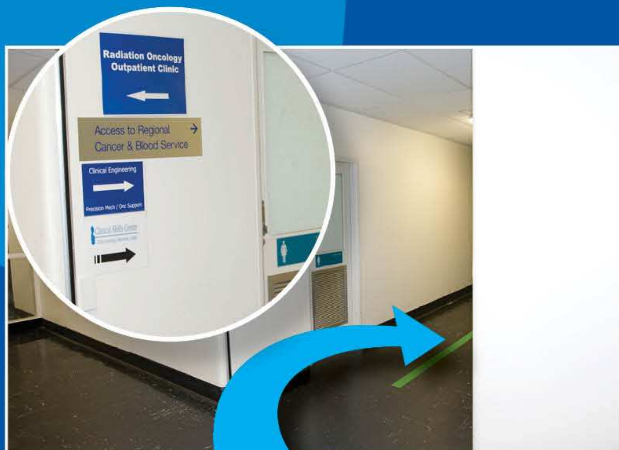
take the next right from where the green line on the floor starts ...