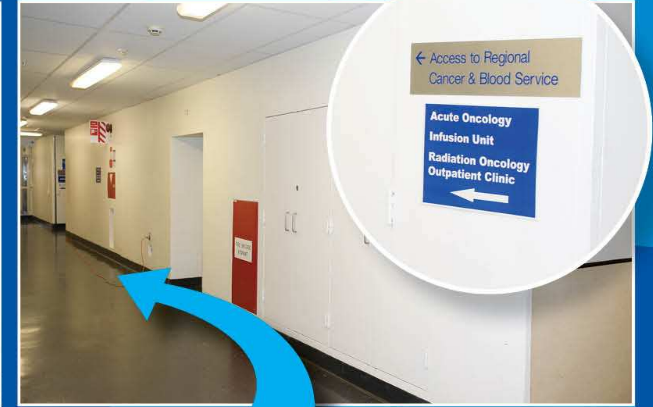
go down the hallway through the next set of doors then turn left ...