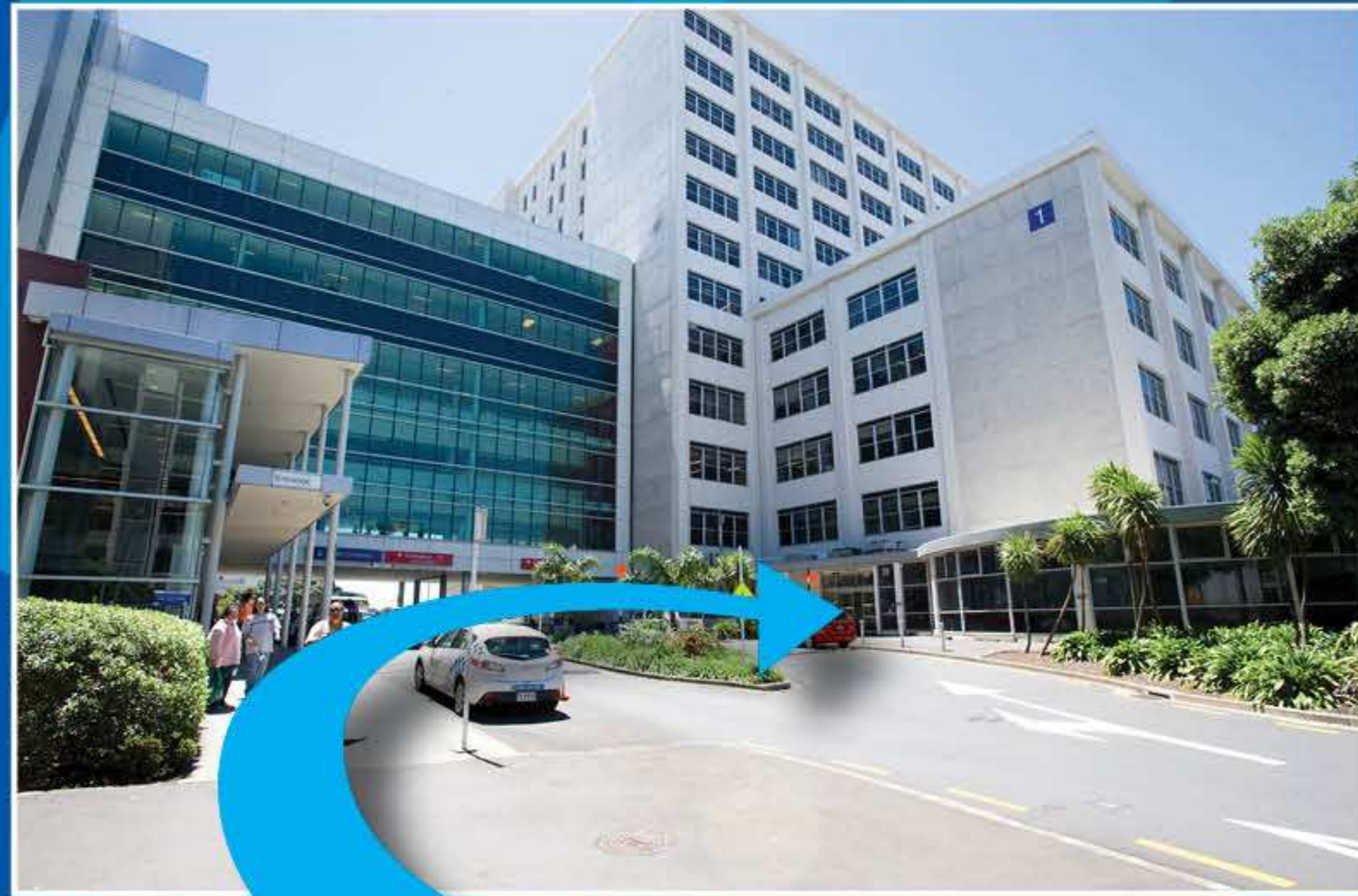
Cross the zebra crossing outside the main entrance over to the side entrance of the support building ...