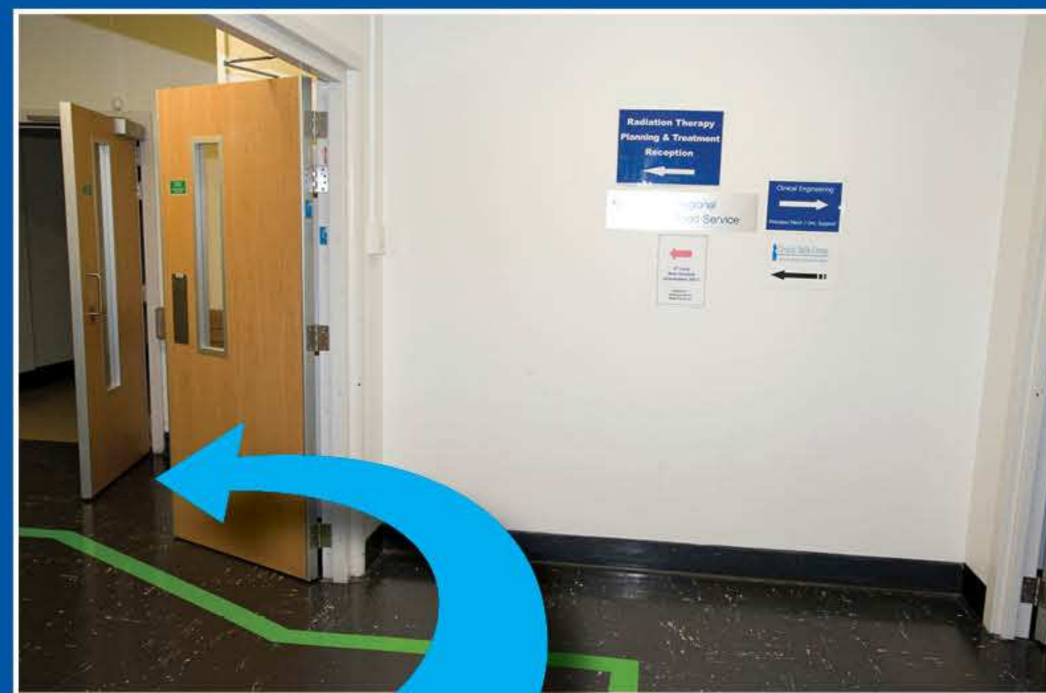
follow the green line straight ahead and then left through the double doors ...