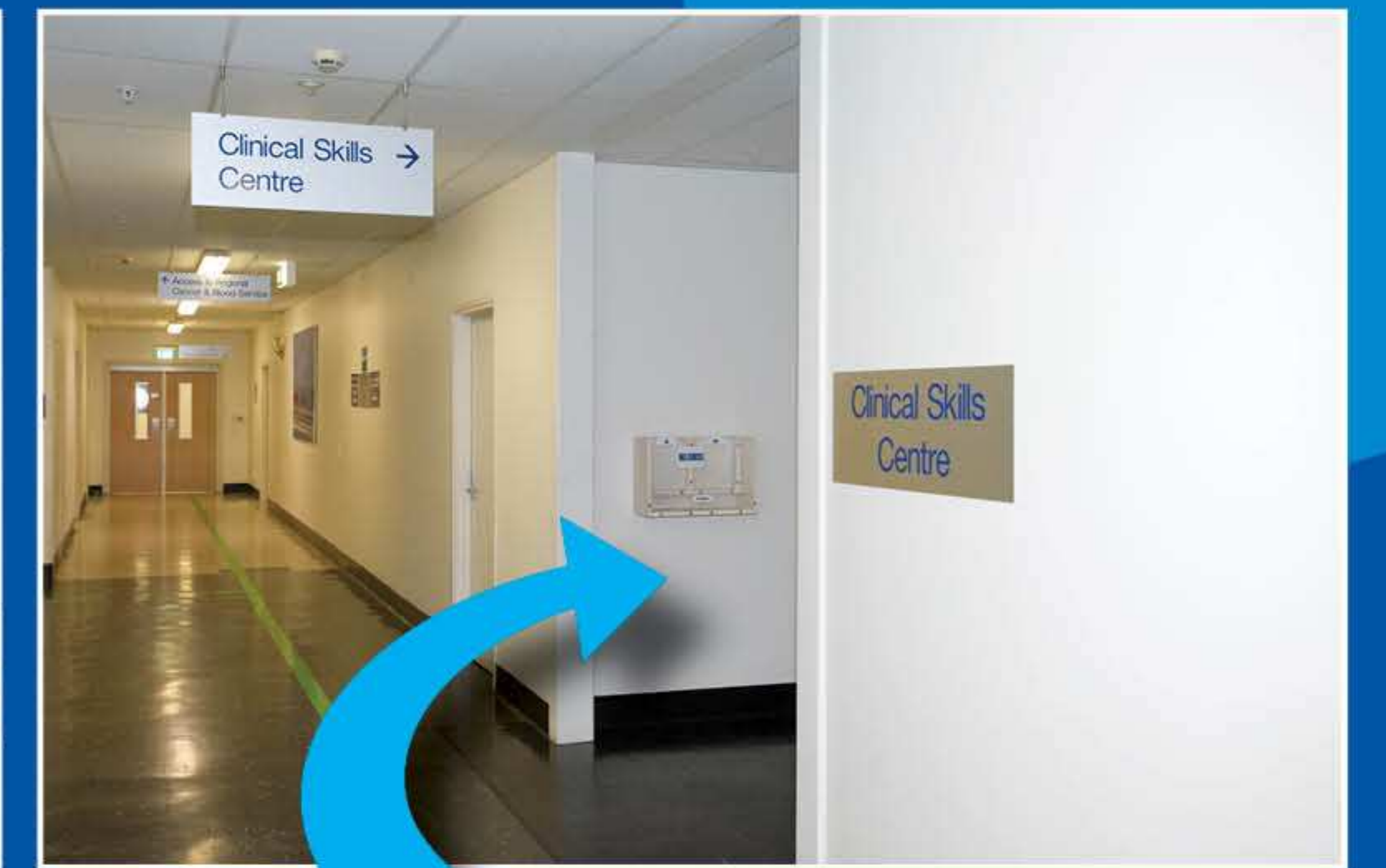
you've reached the Clinical Skills entrance to your right.