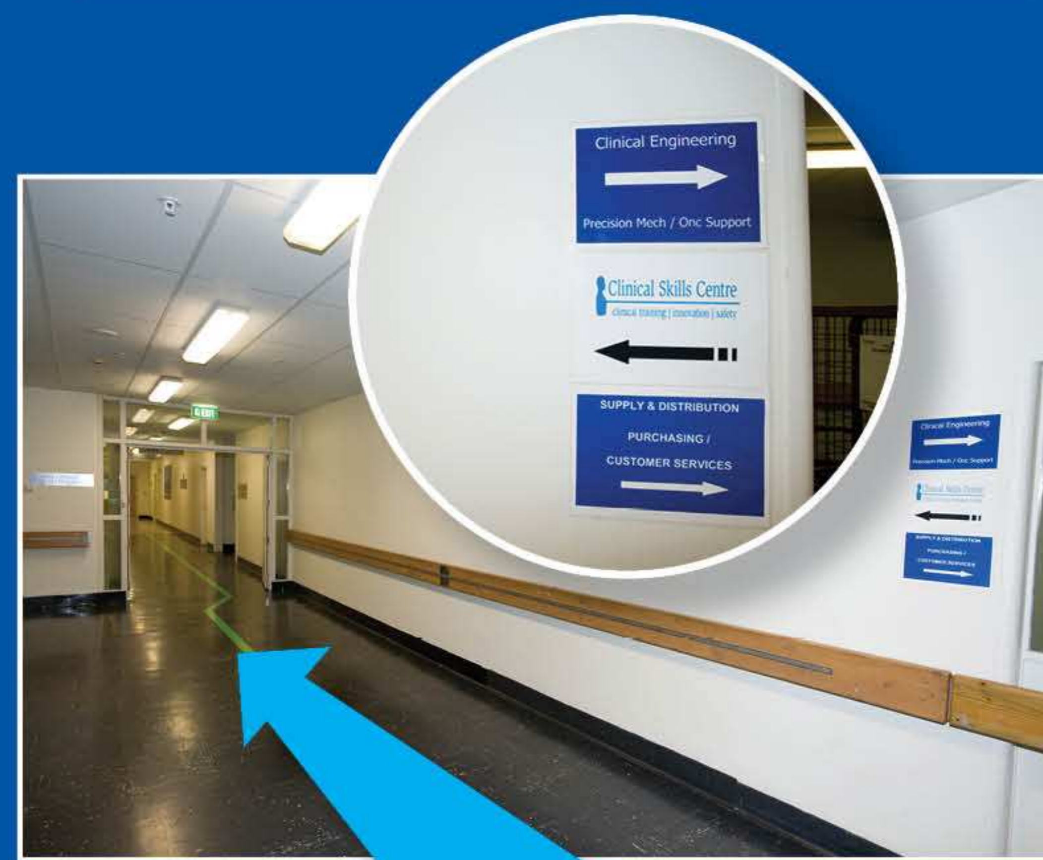
proceed straight ahead through the double doors ahead, passing the lifts on your left...