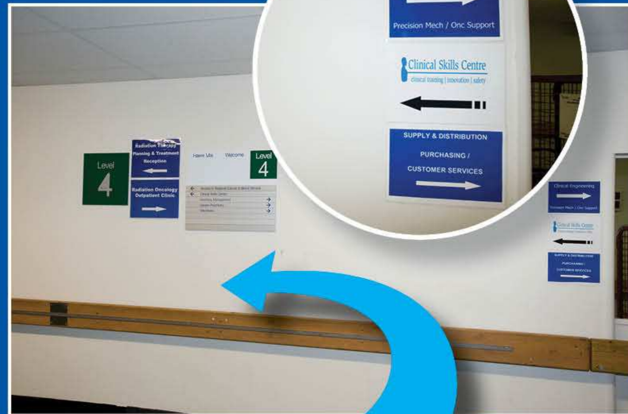
leaving the lift at level 4, turn left ...