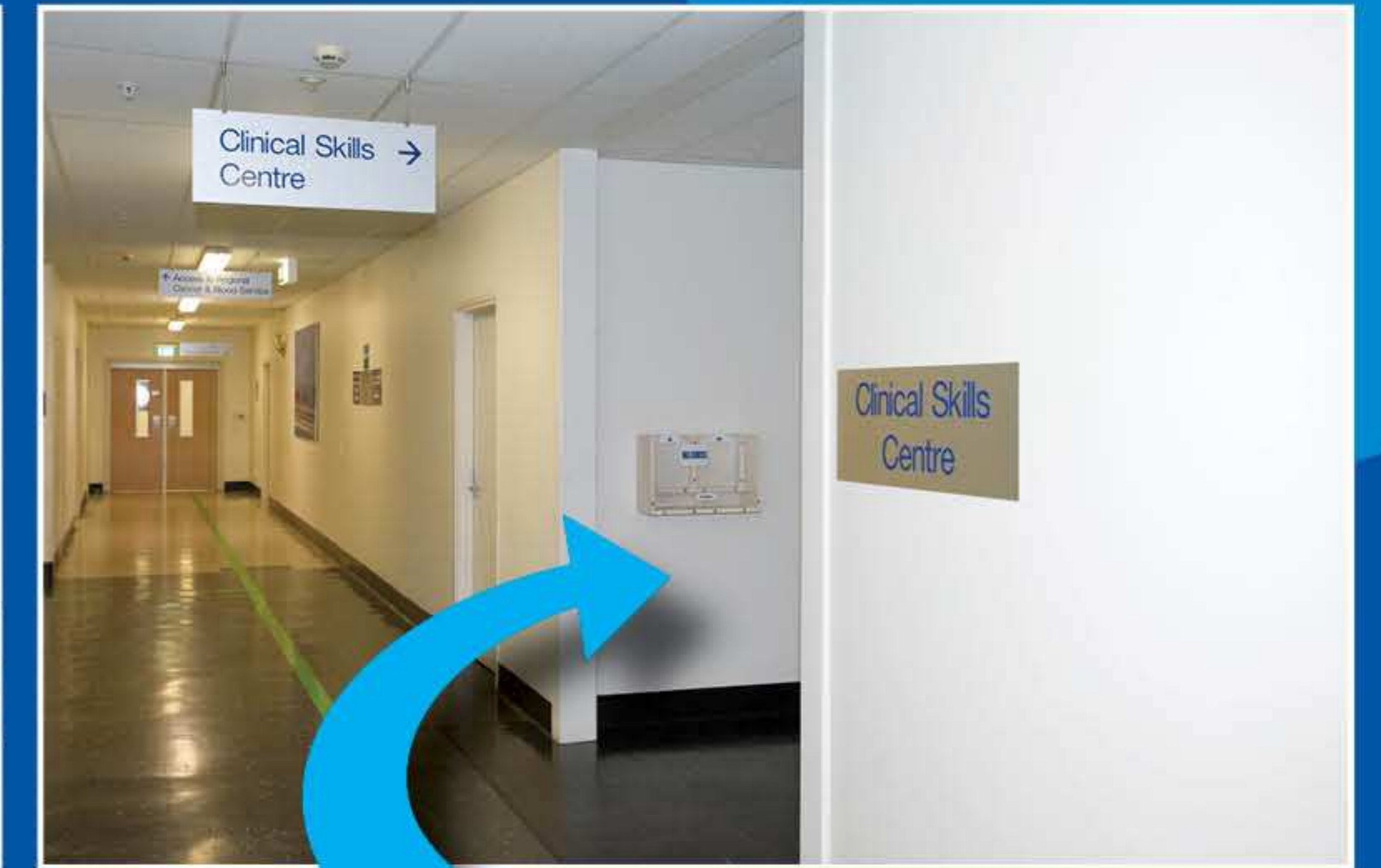
you've reached the Clinical Skills entrance to your right.