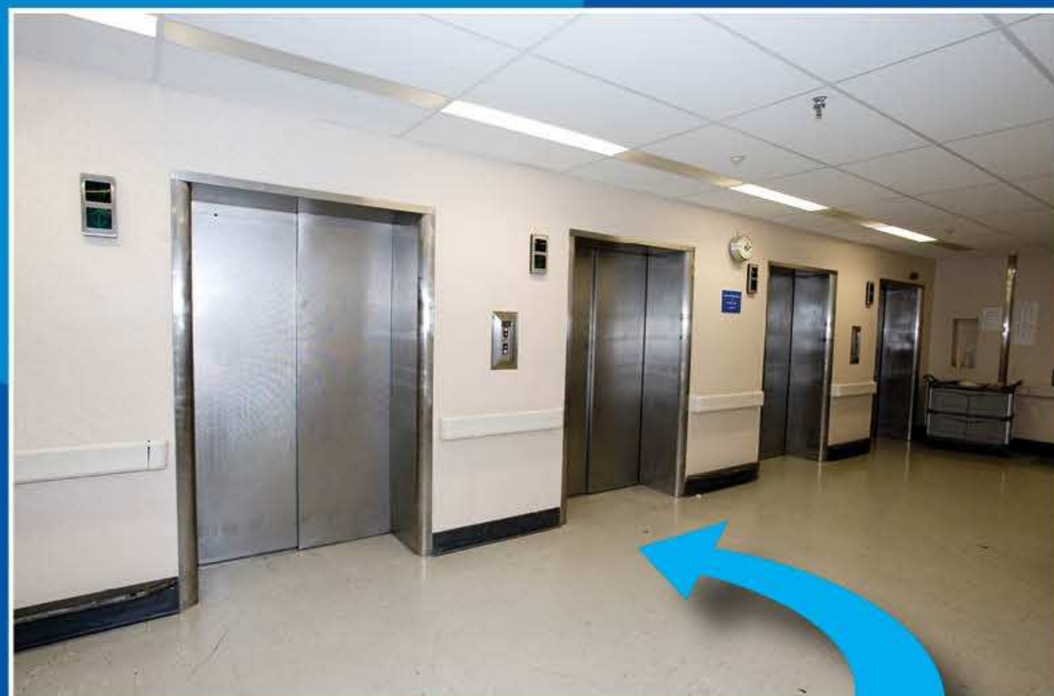
take one of the lifts that appear on your left to level 4 ...