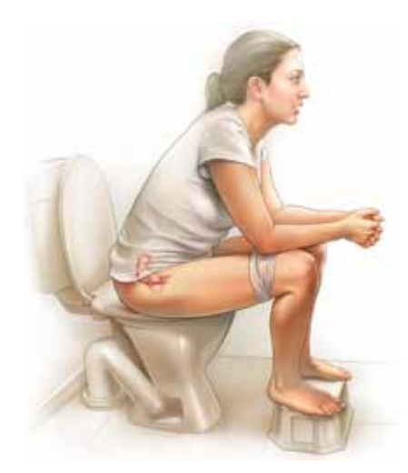
Fig 2: Correct toilet positioning