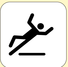
Falls with injury