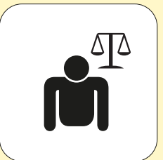
Severe balance issues