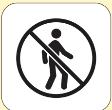
Inability to walk