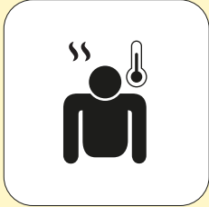
Increased body temperature