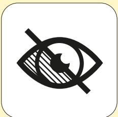
Changes in vision