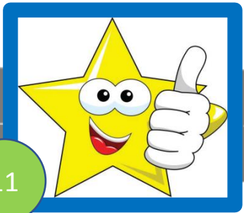
Ei! Tino pai! Me kōrero haere tonu.