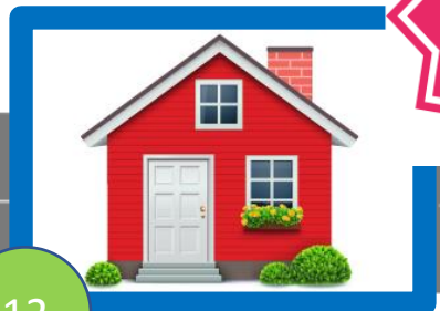
Kua mutu! Ko te wā hoki ki te kāinga.