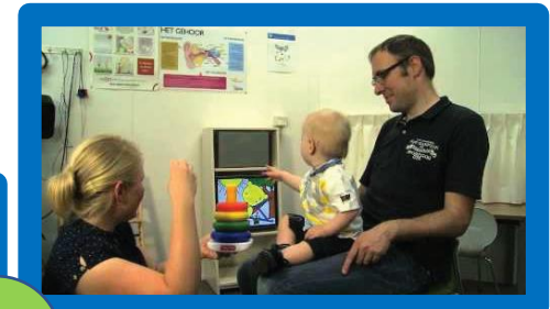
Me huri ka rapa i te karetao, te ataata rānei.