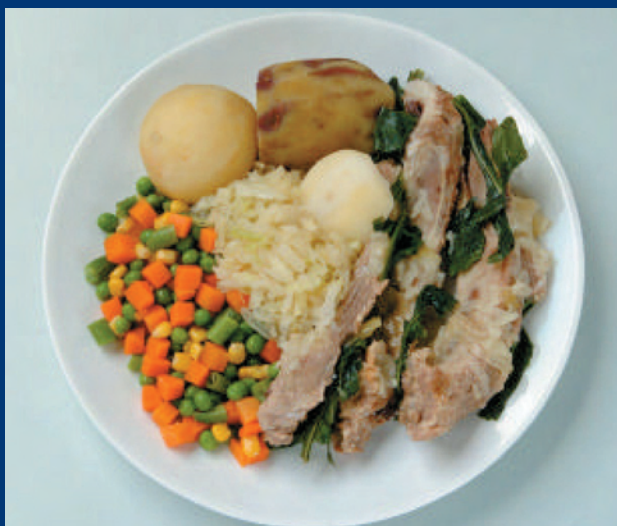
PORK AND PUHA BOILUP WITH POTATO, KUMARA AND VEGETABLES