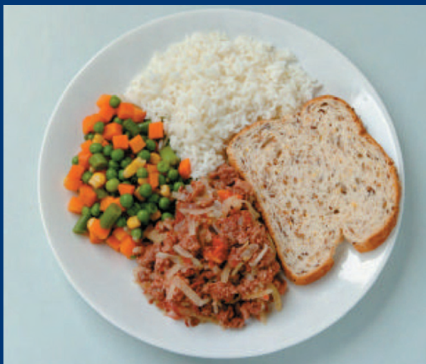
CORNED BEEF BOILUP WITH RICE, BREAD AND VEGETABLES