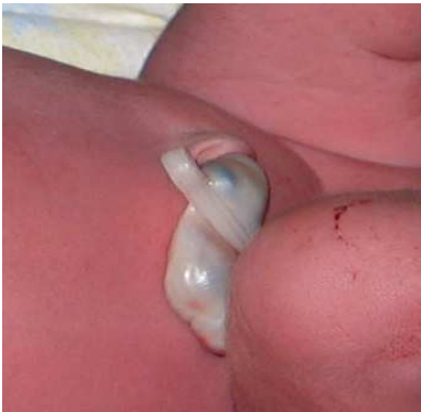
Picture of newborn with cord/pito still attached and clamp in place

At first the cord/pito appears blue-white and then gradually yellows to brown and then black.