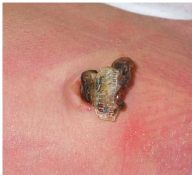
Cord/pito after it has dried and clamp removed

The plastic cord clamp used at birth is usually removed once the cord/pito is dry.